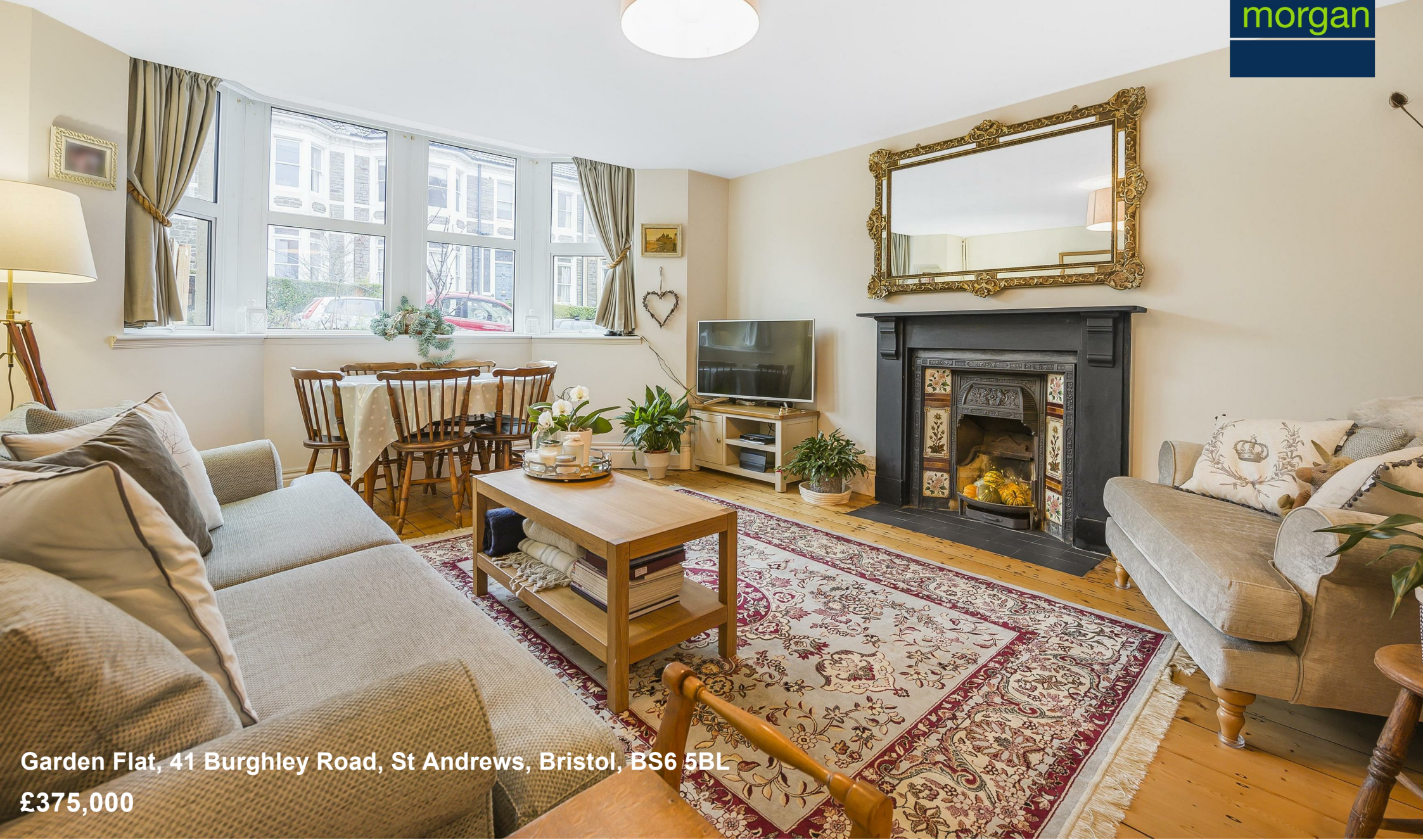
Garden Flat, 41 Burghley Road, St Andrews, Bristol, BS6 5BL